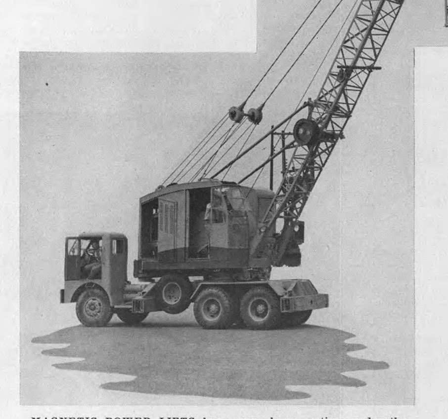
MAGNETIC POWER LIFTS huge crane boom sections under the watchful eye of Jesse A. Floyd, 2417, the magnetic crane operator. The big magnet can raise 5,000 pounds and when the crane is fitted with a hook it can lift 20 tons. Operating the crane tractor here is Stanley D. Brooks, 2417.